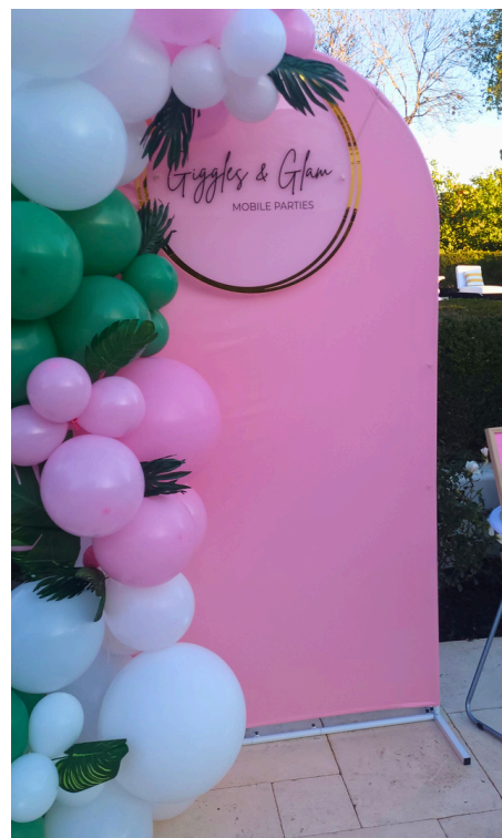
BALLOON ARCH WITH DECOR ADD-INS

Add in banana leaves, florals, etc. for a unique touch!