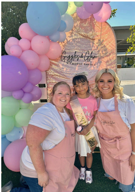
WIDE BASE FLOOR TO TOP OF ARCH (12FT)