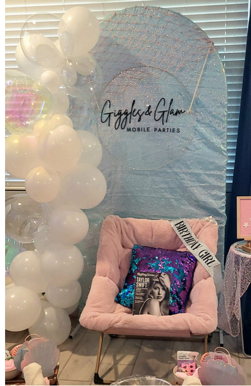
FLOOR TO TOP OF ARCH (10FT)