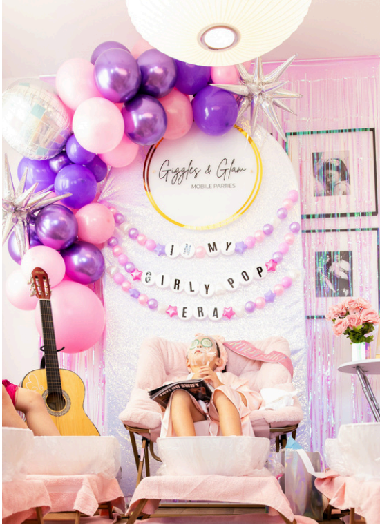
CORNER GARLAND (6FT)

**$10 per foot of balloons, pricing for add-in decor available as a customization